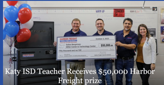
Katy ISD Teacher Receives $50,000 Harbor Freight prize